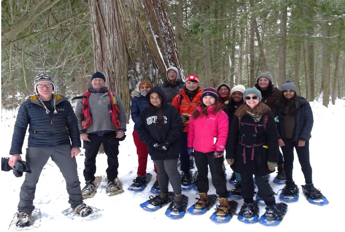
UBC International Students and the Wells Gray Community Forest; collaborate on Management Plan.