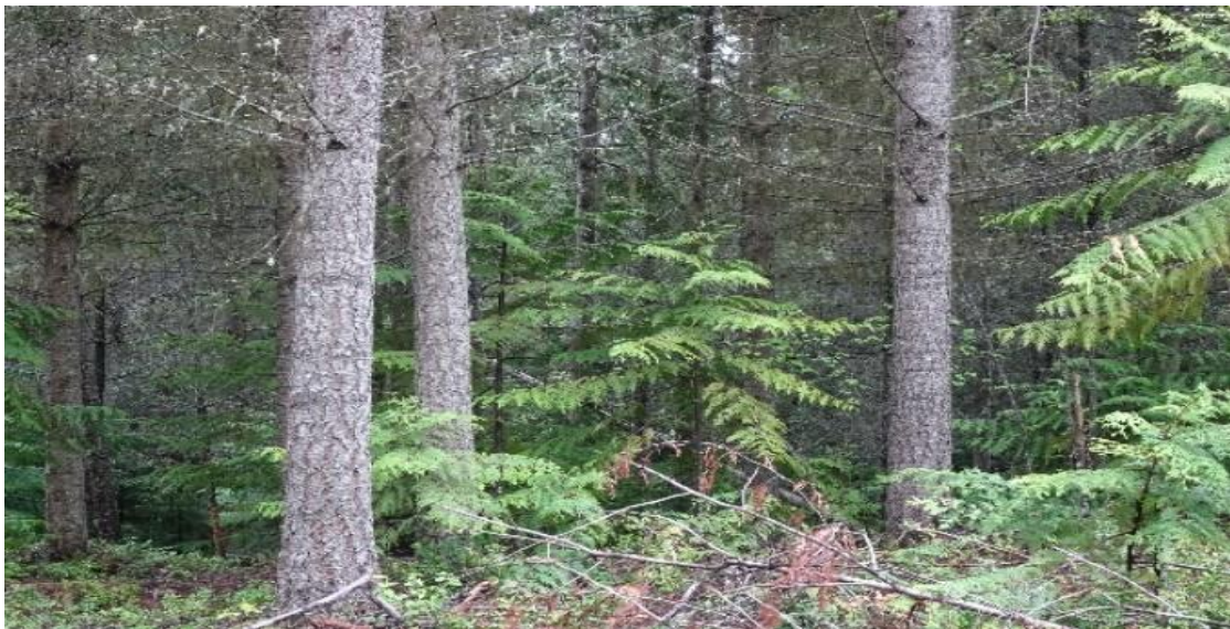
Forty-Five-Year-old Douglas Fir Plantation.

The Community Forest acquired a Lidar data set for its entire land base in 2019, this high-resolution imagery was used in the planning of landscape fuel management, future harvest planning, recreation trail location and provided details on the future expansion of the CF land base. This Lidar set has improved the accuracy of the data which was used to update the timber supply calculation in 2022. This timber supply calculation has provided the General Manager and the Board of Directors with the most up to data, to make the decision to reduce the Annual allowable cut over the next 10 years. This investment and decision is to ensure the long term timber supply of the Wells Gray Community Forest is correct.