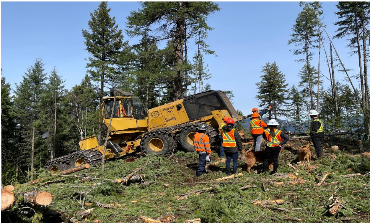
Field trip viewing Volks Trans; Steep Slope Tethered harvest system.

The Wells Gray Community Forest required Steep Slope logging procedures on several harvesting locations. These procedures were implemented on the ground during winter harvesting locations, this was successful because of the care taken by our local loggers.