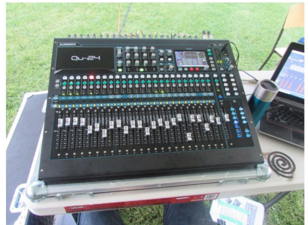
Our Sound Board