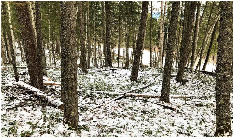
Post treatment in mature stand – 80 years old.

WGCFC was successful in securing funding for spring 2020 from the government, this funding was awarded to an out-of-town contractor who completed fuel management treatments over two field seasons. This project was completed in 2022, with the lengthy delay of burning the debris associated with the treatment, this is an ongoing challenge.